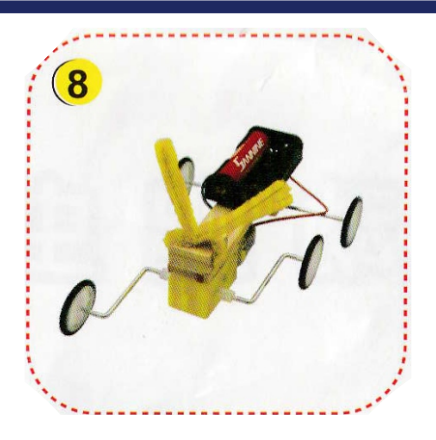
Step 8: Twist the pipe cleaner wire so you can add the eyes