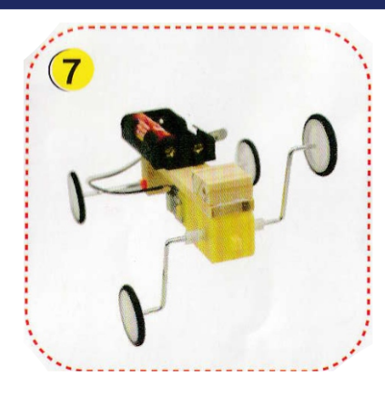
Step 7: Add the rubber band to the pullies