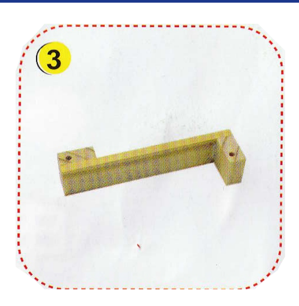
Step 3: Paste the wooden blocks on the wooden strip. Make sure the holes are facing up and that one is horizontal and one, vertical (as shown)