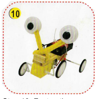
Step 10: Fasten the battery with cable ties to make it more secure