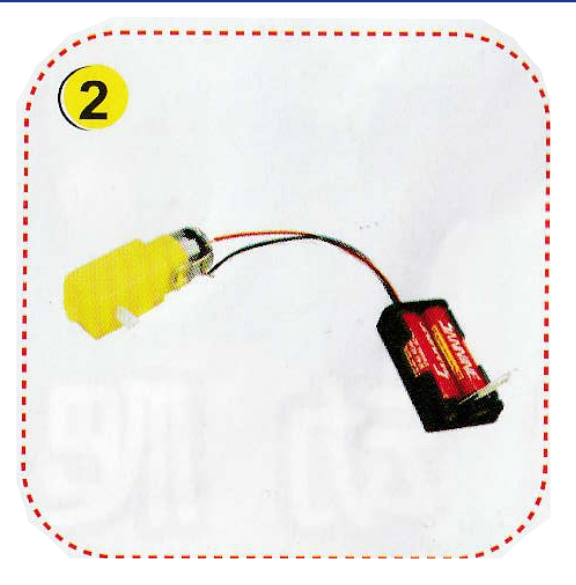
Step 2: Connect the wires to the motor. There is a small loop on each side where you can thread the wire through, twist the wire to secure