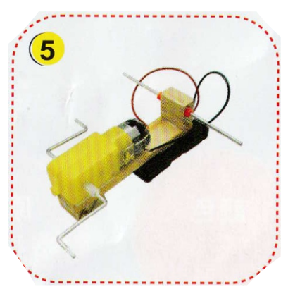
Step 5: Put the long shaft with bushings on each side through the vertical block. Add the angle shafts to the motor