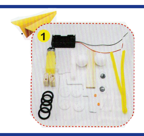
Step 1: The material is as shown in the figure: The white glue solidifies and stick slowly.

DIY instruction manual: a clear and complete scientific instruction manual for children to learn, allowing your children to independently explore their own world and exercise their ability to solve problems.