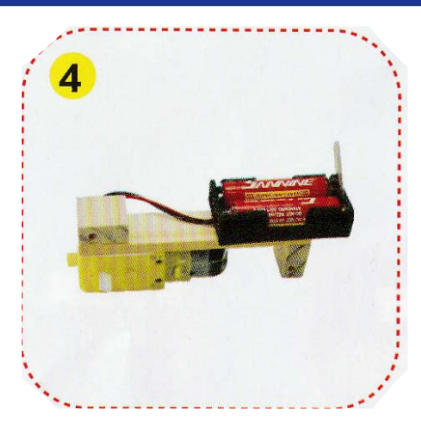
Step 4: Glue the motor on side of the vertical block and the battery holder on the side of the horizontal block (as shown)